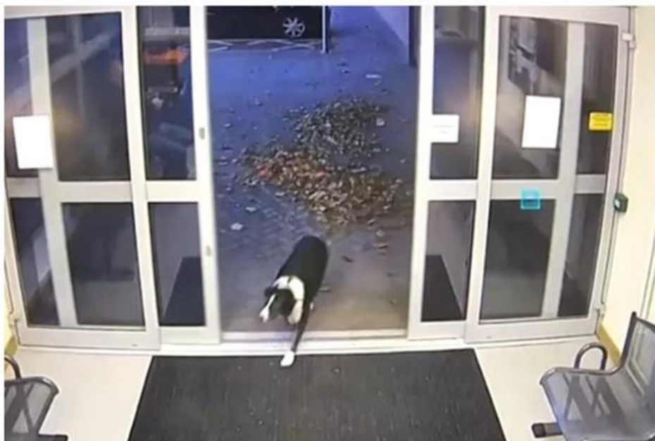
Pictured: Rosie walking into the Police Station.