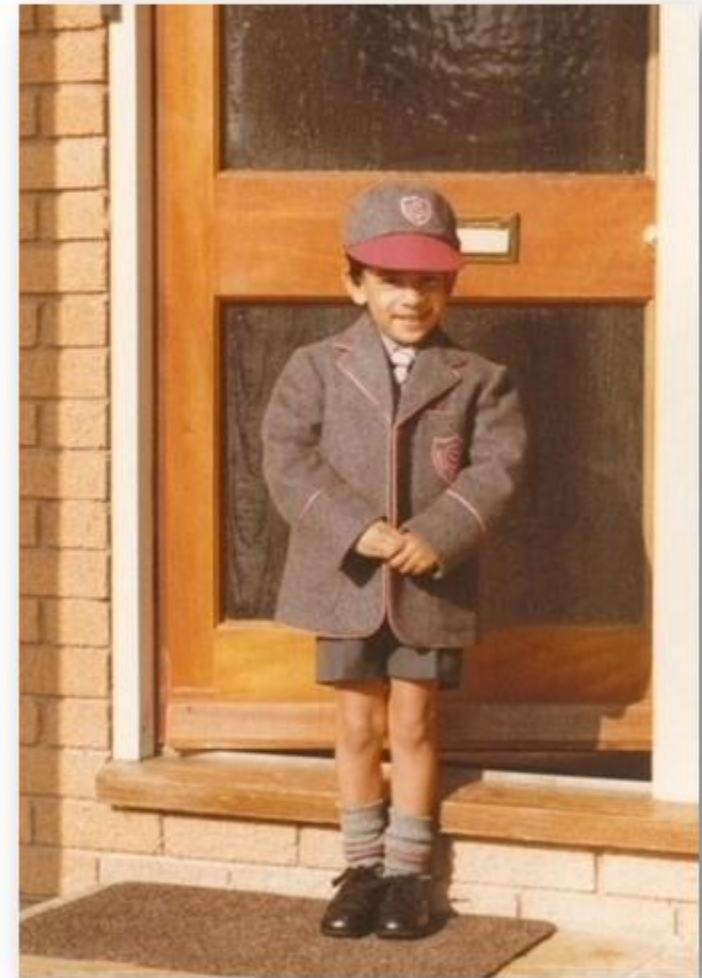
Rishi Sunak Twitter

We need stability and unity and I will make it my utmost priority to bring our party and our country together.