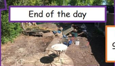
End of the day