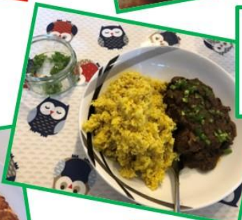
Beef dopiaza with pilau rice