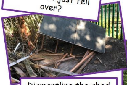
Dismantling the shed and the end of the garden. Next step is filling a skip