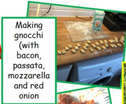
Making gnocchi (with bacon, passata, mozzarella and red onion)