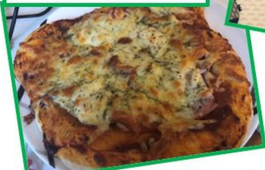
Homemade pizza with pepperoni, red onion, ham, Edam, mozzarella and chipotle paste in the sauce