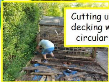
Cutting up the decking with a circular saw