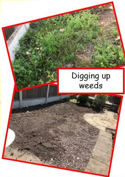
Digging up weeds