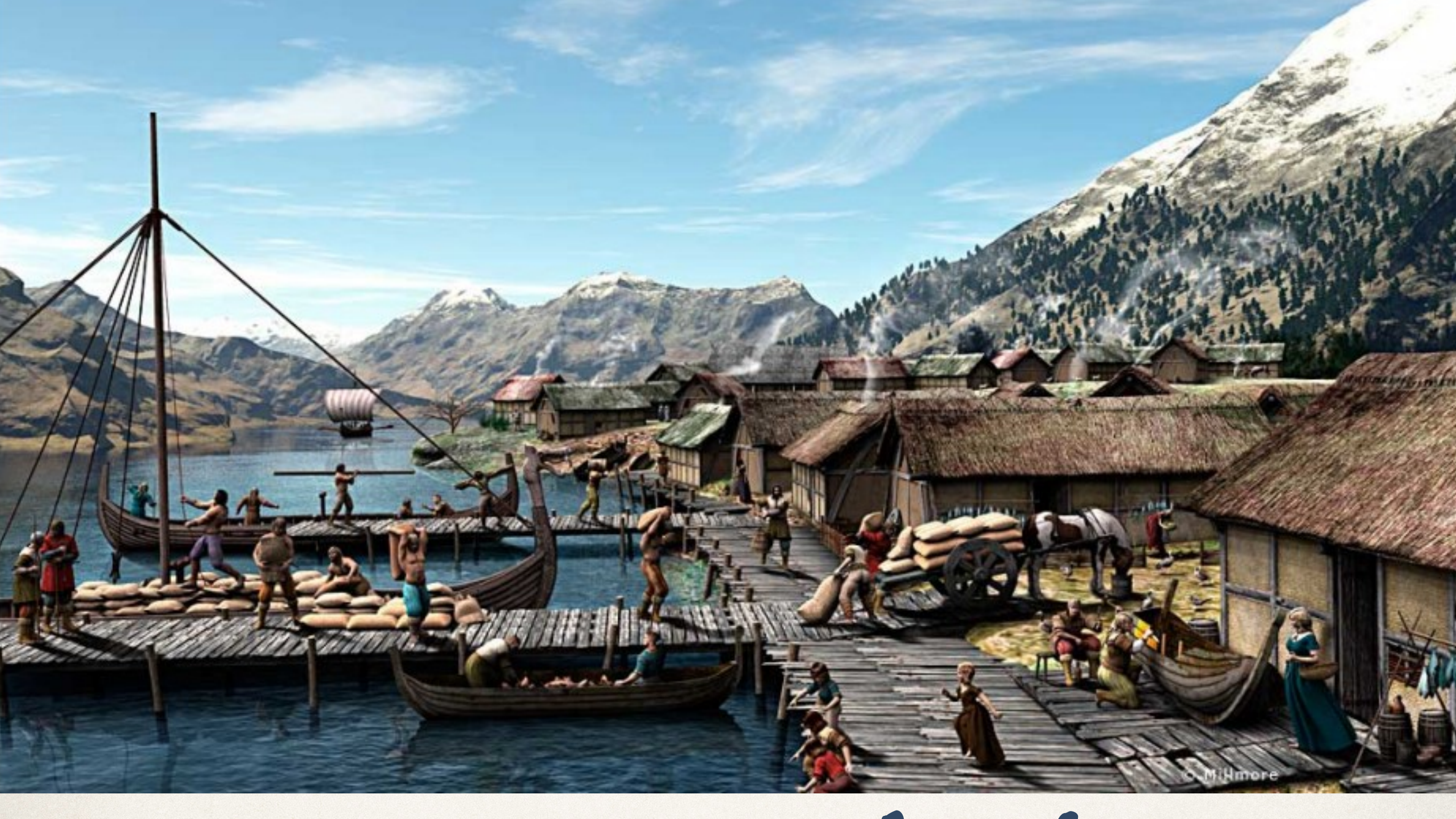
Singing & Music in the Viking Age