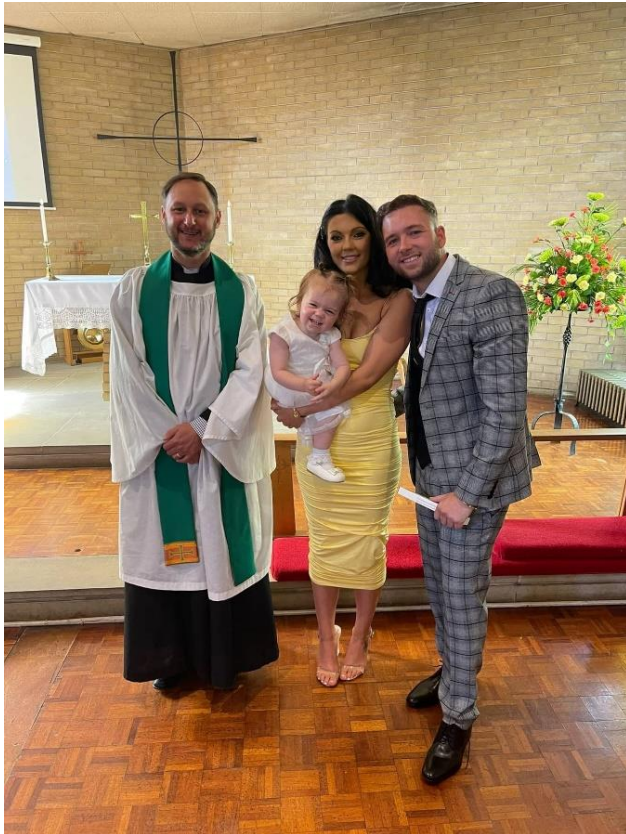
Families being able to celebrate together again has brought much joy