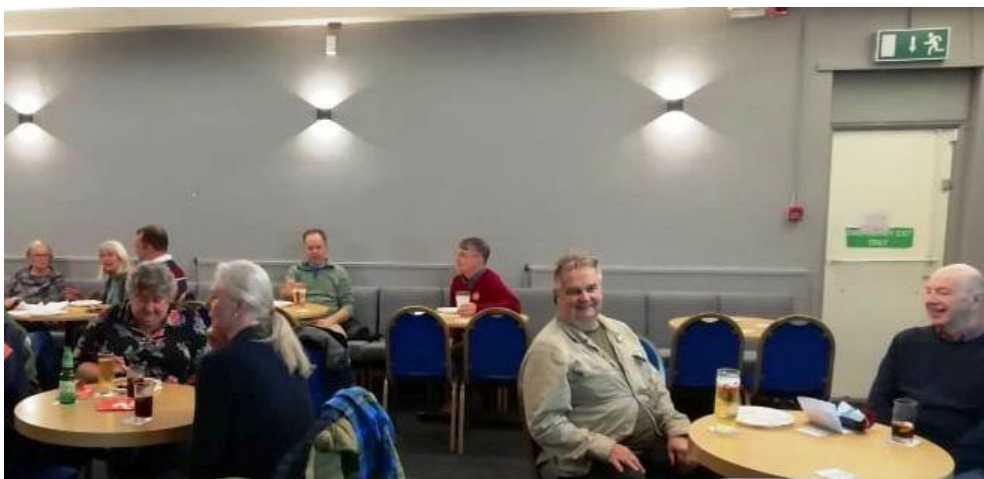
Meal time at Alpha