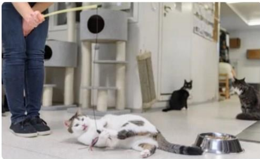
Pictured above: a volunteer playing with a cat in an animal shelter.

Not all animal shelters are the same but generally, they are an establishment that provides a temporary home for dogs, cats and/or other animals that are lost, unwanted or abandoned (this includes situations out of an owner's control). Their aim is to care for the animals until they can find suitable homes and are adopted. Animal shelters rely heavily on charitable donations.