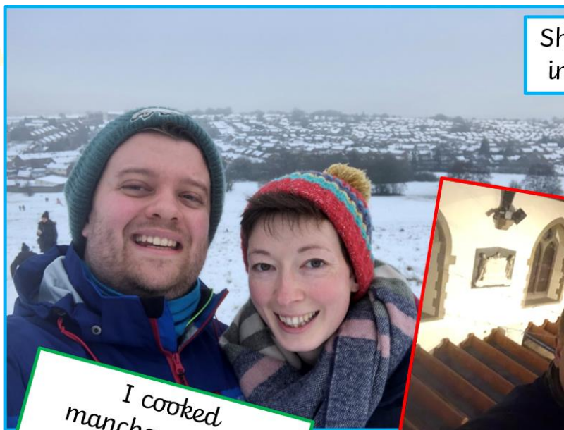
Shell and me in the snow