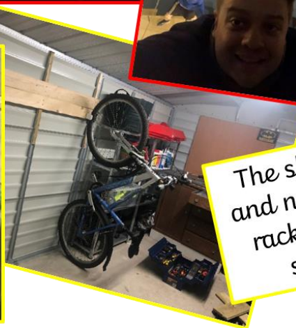
The shelves and new bike rack in our shed.